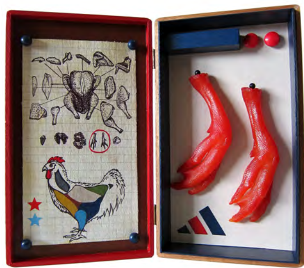
CHICKEN GALORE Various objects in wooden cigar box Closed - 14 x 24 x 4.25 cm. Open - 28 x 24 x 4.25 cm. 2012