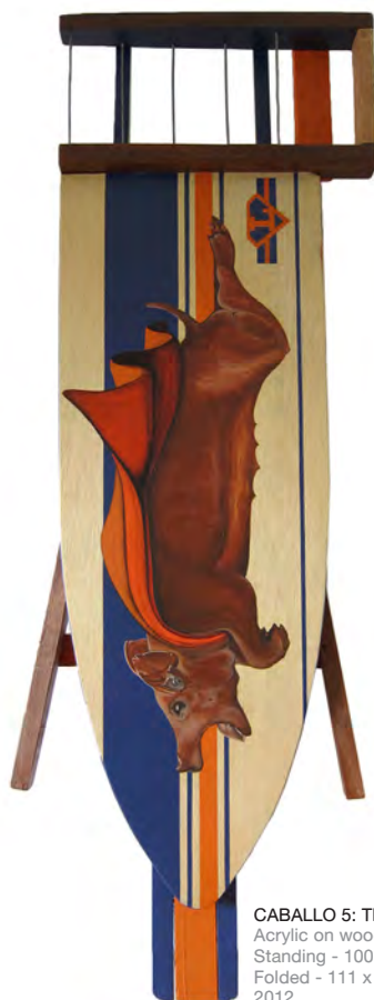
CABALLO 5: THE RETURN OF SUPER LECHON Acrylic on wooden ironing board Standing - 100 x 76 x 36 cm. Folded - 111 x 12 x 40 cm. 2012