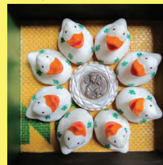
Aborted Delicacy (Calamansi Flavor) (detail) Closed - 13.25 x 11.5 x 4.5 cm. Open - 13.25 x 23.2 x 4.5 cm.

2010-2011 ■ Thesis Grantee of the College of Fine Arts, U.P. Diliman.