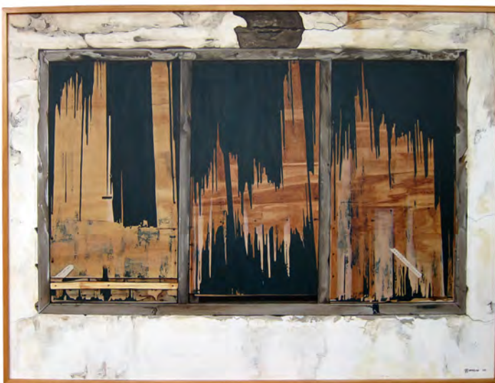
THE ALMOST FORGOTTEN NARRATIVES & ALTERED STATES (PART II) Acrylic on canvas 121.9 x 91.4 cm. 2012