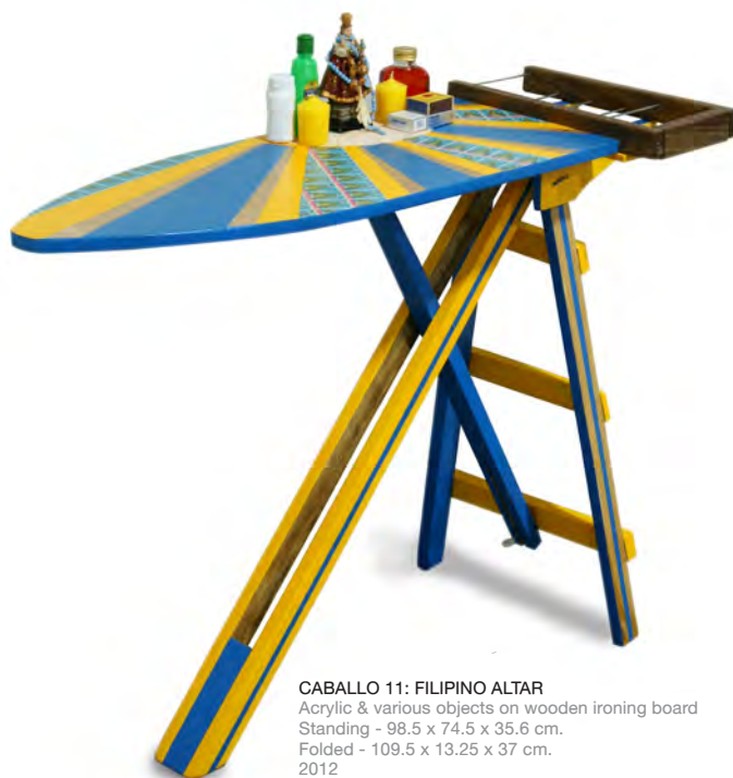
CABALLO 11: FILIPINO ALTAR Acrylic & various objects on wooden ironing board Standing - 98.5 x 74.5 x 35.6 cm. Folded - 109.5 x 13.25 x 37 cm. 2012