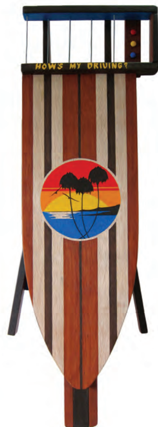
CABALLO 2: TOURISTIC SHIT & THE FILIPINO AESTHETIC (PART I) Acrylic & plastic magnets on wooden ironing board Standing - 98.7 x 75 x 35.5 cm. Folded - 110 x 13 x 37 cm. 2012