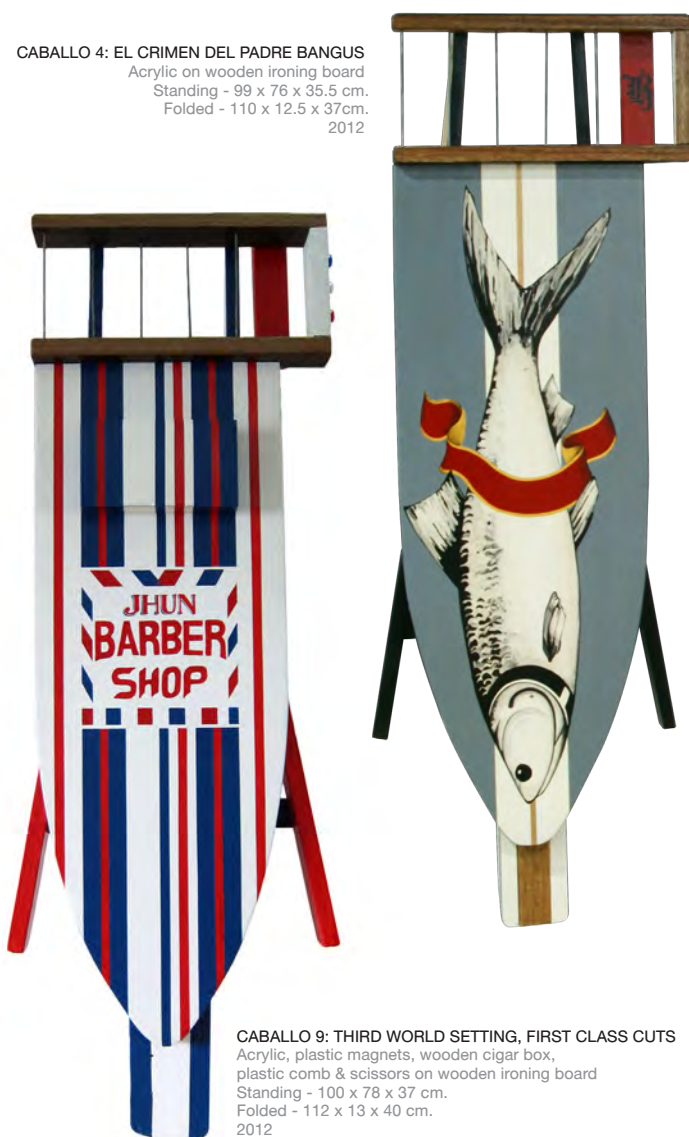
CABALLO 9: THIRD WORLD SETTING, FIRST CLASS CUTS Acrylic, plastic magnets, wooden cigar box, plastic comb & scissors on wooden ironing board Standing - 100 x 78 x 37 cm. Folded - 112 x 13 x 40 cm. 2012