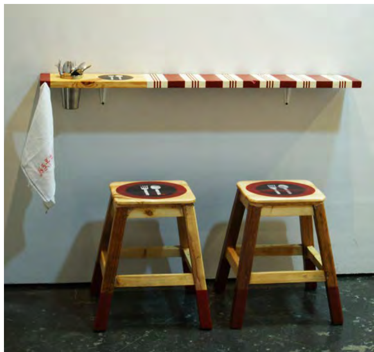
MAKESHIFT DINER (Installation) Acrylic, spray paint, hook, towel, metal cup with forks & spoons, wooden shelf & stools Dimensions Variable 2012