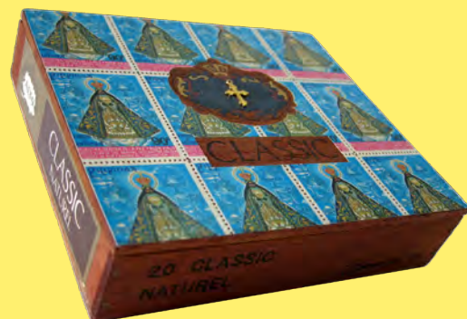
ABORTED DELICACY Various Objects in wooden cigar box Closed - 13 x 11.5 x 3.10 cm. Open - 13 x 23 x 4 cm. 2012