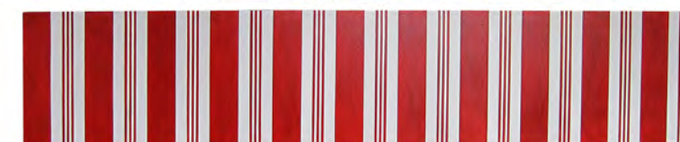
SET UP SHOP Acrylic & color pencil on canvas 152.4 x 152.4 cm. triptych 2012