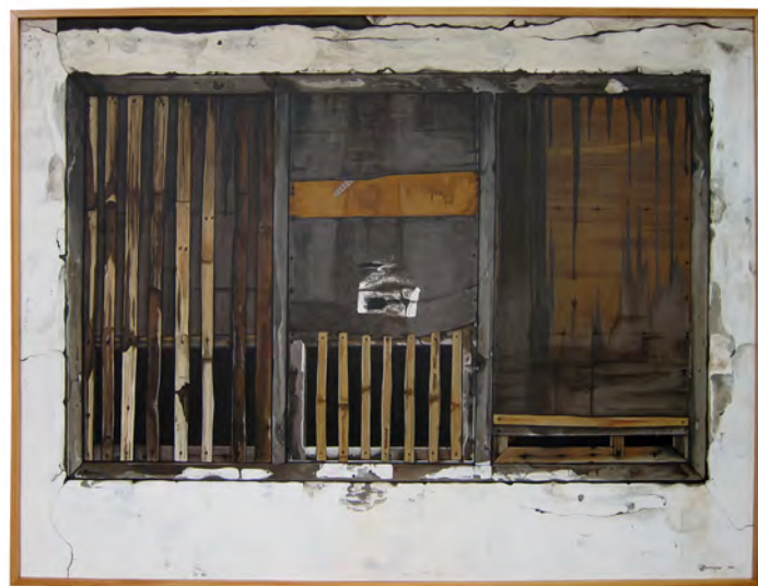
THE ALMOST FORGOTTEN NARRATIVES & ALTERED STATES (PART I) Acrylic on canvas 121.9 x 91.4 cm. 2012