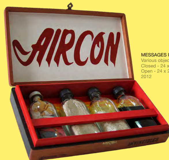
MESSAGES IN BOTTLES Various objects in wooden cigar box Closed - 24 x 14 x 4 cm. Open - 24 x 28 x 4 cm. 2012

The artist begins as a sightseer, an avid one at that. As a child he moved around quite often with his parents across different continents, honing his wandering eyes to take in as much as well as to make sense of the mingling stimuli. Then, the traveler settles, inflecting his history of sightseeing with the sensibility of an excited resident or a wistful returning sojourner. When he takes this pause, he recovers a place, which he has seen before but is in the present reviewed through the lens of a re-acquaintance and a possible coming to terms with a past that is now before him. He engages with the place that is the Philippines, which is a part of his heritage, his mother being a Filipino. With his body in place after years of trips back and forth, he looks at what used to be a distant object with renewed disposition as an intimate subject, not fully fathomed nor completely intuited, but ceaselessly made fascinating, cherished for its charms.