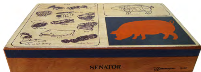
PORK GALORE Various objects in wooden cigar box Closed - 24 x 14 x 4.25 cm. Open - 24 x 28 x 4.25 cm. 2012