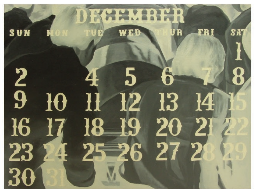
HOLIDAY 2 Acrylic on canvas . 36 x 48.25 inches . 2010