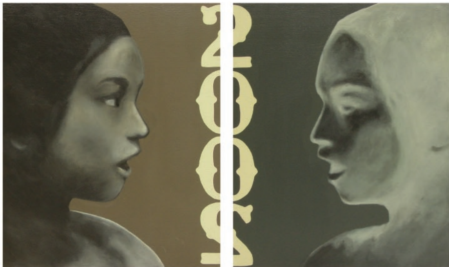
MIRRORED Acrylic on canvas . 24 x 39.5 inches (diptych) . 2010