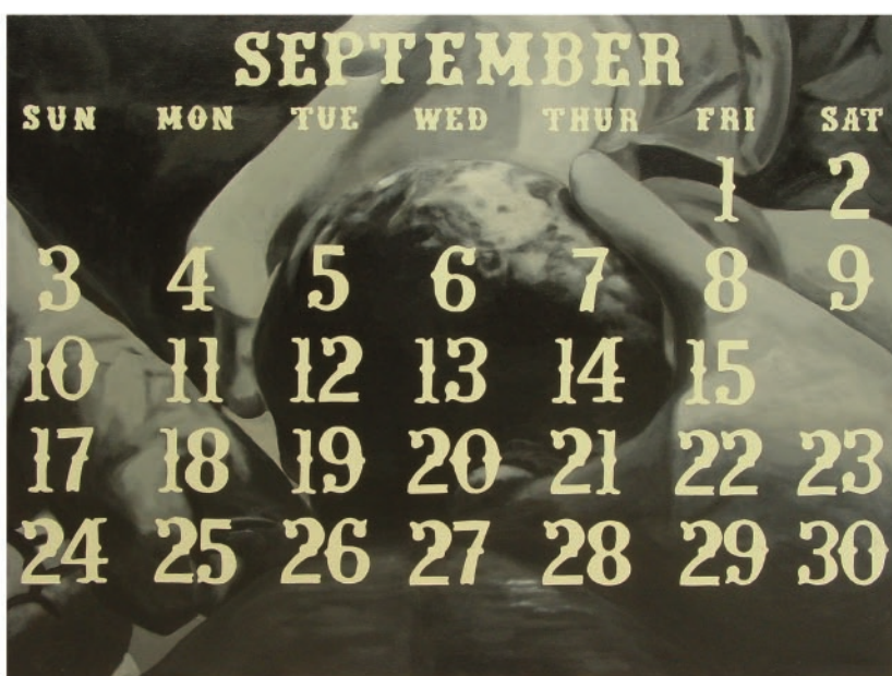
HOLIDAY 1 Acrylic on canvas . 36 x 48.25 inches . 2010