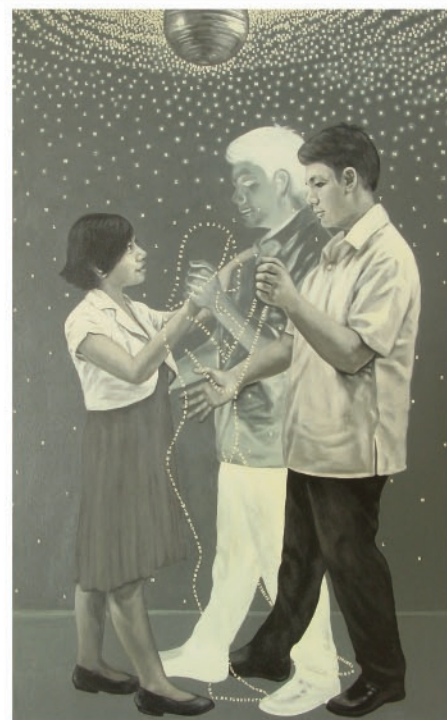
INTERVAL FLAME Acrylic on canvas . 68 x 42 inches . 2010