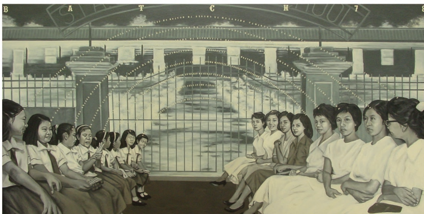
DISSECTIONAL HOMECOMING Acrylic on canvas . 42.25 x 84.25 inches . 2010