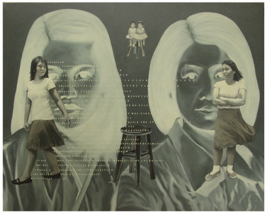
RECOLLECTION Acrylic on canvas . 48 x 60 inches . 2010