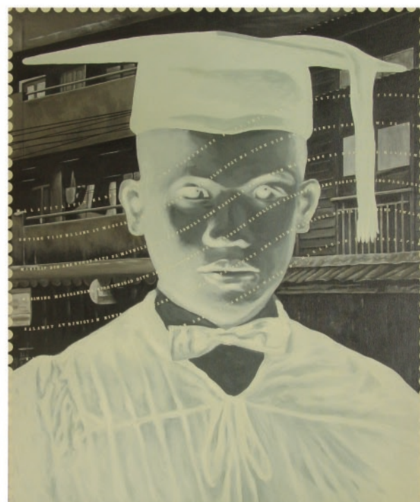
BOARDER Acrylic on canvas . 54 x 45 inches . 2010