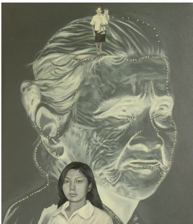
YAYA EMERITUS Acrylic on canvas . 48.25 x 41.75 inches . 2010