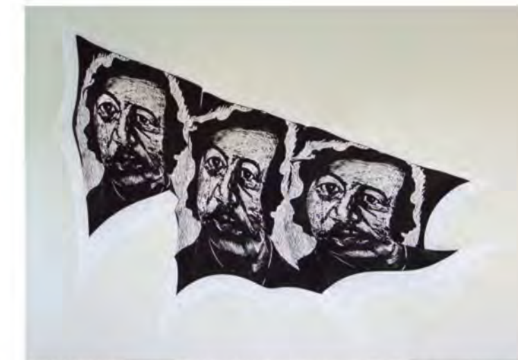
SALAMANGKERO Installation of rubbercut to serigraph prints on stretchable textile stuffed with foam and various objects, image size 91.44 cm x 91.44 cm (three pieces), 2013