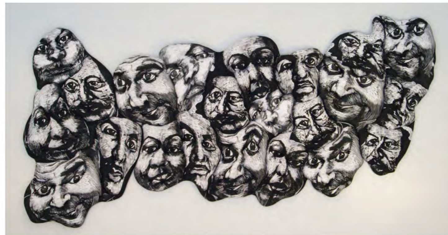
FROM LEFT TO RIGHT: Transfigurations 2, 1 and 3. Installation of rubbercut to serigraph print on stretchable textile stuffed with foam and various objects. Three pieces joined. Sizes from left to right: 233.68 x 137.16cm, 210.82 x 284.48cm and 228.6 x 142.24 cm, 2013

2012 ■ RECIPIENT, Asian Cultural Council Artist Residency Program (New York) PHILIPPINE REPRESENTATIVE, Speaking House Art Camp, Kerala, India 2011 ■ RECIPIENT, Alliance Francaise de Manille Philippine Artist Residency Program Grant (Paris) 2006 ■ GRAND PRIZE, Philip Morris Philippine Art Awards 2003 ■ BEST ENTRY PRINT CATEGORY, Bantay Kalikasan Art Competition 1998 ■ FINALIST PHILIP MORRIS PHILIPPINE ART AWARDS, Glorietta Mall, Makati City 1987 ■ GRAND PRIZE PAINTING CATEGORY, AAP Open Art Competition