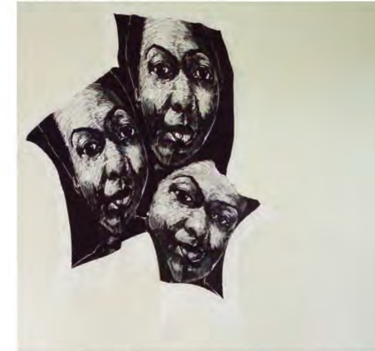
GURO Installation of rubbercut to serigraph prints on stretchable textile stuffed with foam and various objects, image size 91.44 cm x 91.44 cm (three pieces), 2013

technical virtuosity of her handling of line and form, we also wonder at the numerous configurations she summons of print.