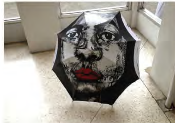
I LOVE THE RAINY DAYS Installation of rubbercut to serigraph print on stretchable textile on object, image size 91.44 cm x 91.44 cm, 2013