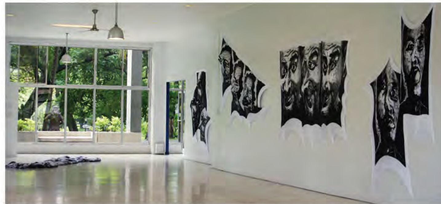
Exhibition Installation of MOLLIFIED, GURO, SALAMANGKERO, PAYASO, PILOSOPO at the West Wing Gallery of UP Vargas Museum