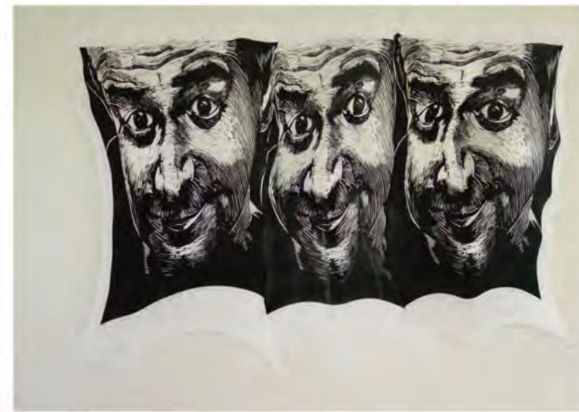
LEFT: AUTORETRATO Installation of rubbercut to serigraph print on stretchable textile, image size 91.44cm x 91.44cm, 2013