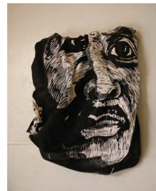
RECONSTRUCTING IDENTITIES (detail)