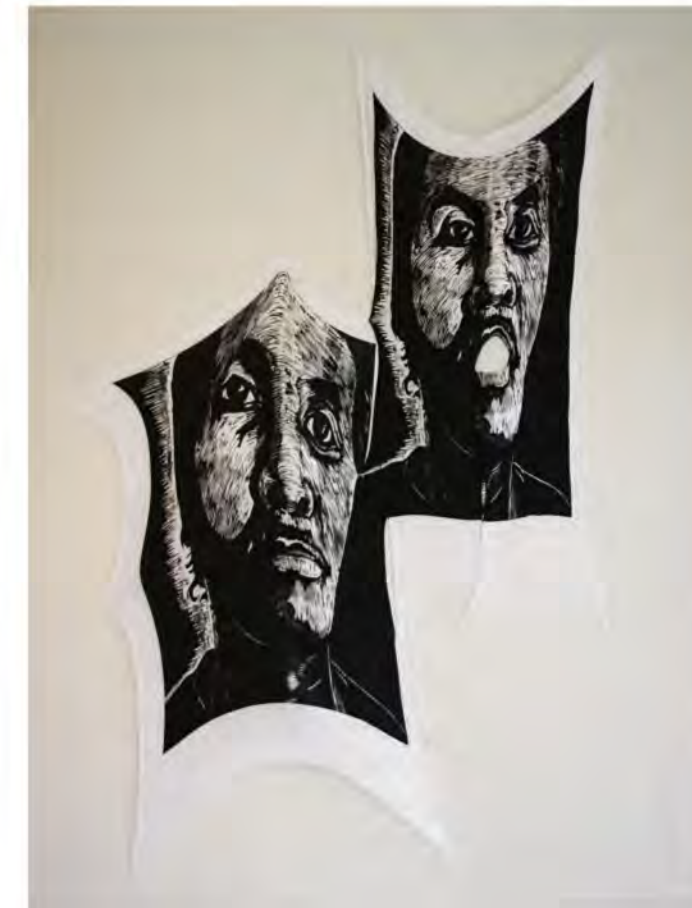
PILOSOPO Installation of rubbercut to serigraph prints on stretchable textile stuffed with foam and various objects, image size 91.44 cm x 91.44 cm (two pieces), 2013

Abano's portraits hinge closely to perceived presence, her interest piqued by features of people's faces. Yet her imagery is pervaded by a sense of indeterminacy, as the faces may either confirm or belie character. Such is her description of print: as 'having its own temperament', an unlikely association as printmaking greatly relies on technical draughtsmanship and precision. 4 For Abano the crafting of image can be regarded as performative, wherein image is imbued life, its contours defined by installation's fertile range. And while we marvel at the