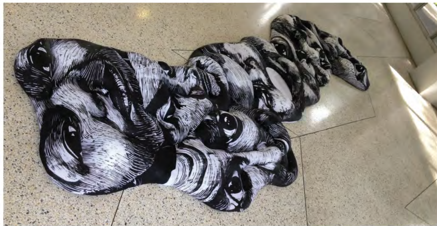
MOLLIFIED installation of rubbercut to serigraph print on stretchable textile stuffed with foam and various objects. Two pieces joined. Sizes: 170.18 x 68.58 cm and 182.88 x 81.28, 2013