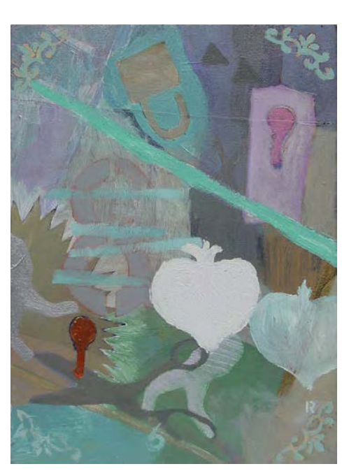
IRMA LACORTE Three Ships 2/12 Acrylic on canvas 39.37 x 29.21 cm. / 15.5 x 11.5 in. 2010