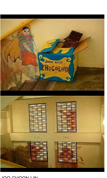
JOO CHOON LIN Come Out And Play! 2 76/100 Video, 6:03 mins. 2009