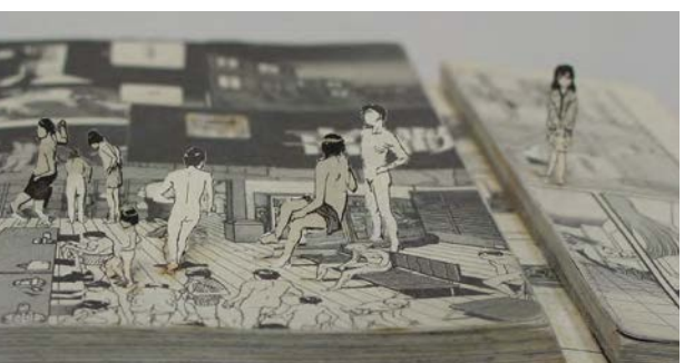
Lost In Eden (detail)