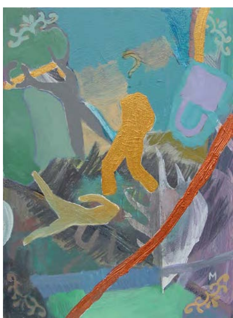
IRMA LACORTE Three Ships 3/12 Acrylic on canvas 39.37 x 29.21 cm. / 15.5 x 11.5 in. 2010