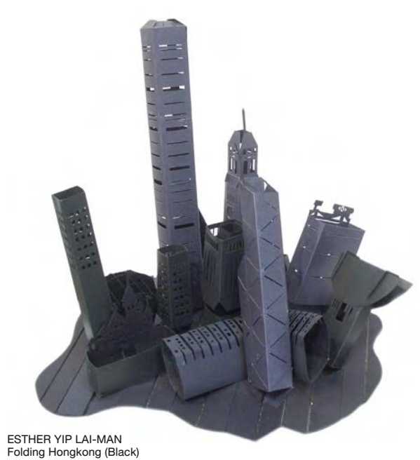
Mixed media 90 x 60 x 45 cm. / 35.43 x 23.62 x 17.72 in. 2010

Whatever the subject, a conversation in this structure can go on as long as the beer holds its dew. Small Talk is but an entry point to a promising variety of dialogue, where the works are equally provocative to other trajectories of thought. Like an urban traffic of creative projections, we revel: the smell of diesel fumes on our clothes, wafts of roast, chilli and curry, to the saccharine textures of a stretch of highways, the cold concrete greys of our alleyways and the circus primaries of our local politics. We swap stories of our everyday lives.