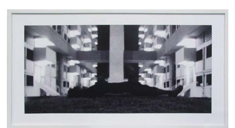
TANG LING-NAH Grassbed #2 From The Series Self-portrait Ophelia