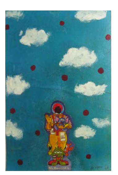
MIDEO CRUZ Untitled Mixed media 26 x 34 cm. / 10.24 x 13.4 in. 2011

Acrylic on boards 35.56 x 48.26 cm. / 14 x 19 in.