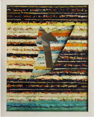
MARC GABA Color, Volume, Motion on the Limits of Illustrating Memory and Back

Photograph, mirror and wood 40 x 28.5 cm. / 15.75 x 11.22 in. 2011