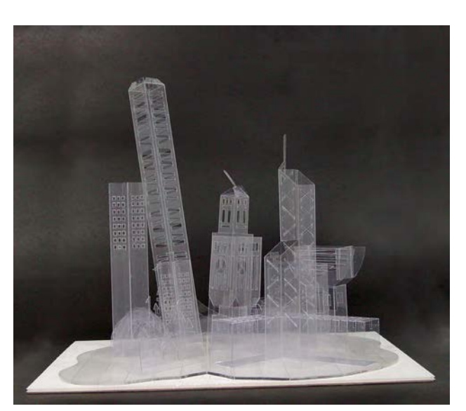
ESTHER YIP LAI-MAN Folding Hongkong (White) Mixed media 90 x 60 x 45 cm. / 35.43 x 23.62 x 17.72 in. 2010