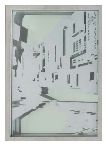
Meanwhile We Happen

Photograph, mirror and wood 40 x 28.5 cm. / 15.75 x 11.22 in. 2011