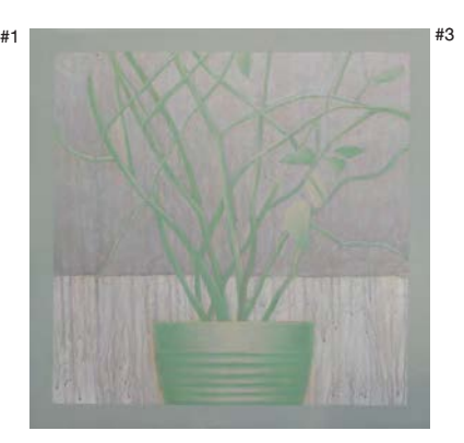
THOSAPOL BORIBOON Hush Series #1, #3

Acrylic on canvas 52 x 52 cm. / 20.47 x 20.47 in. 2011