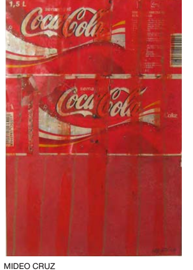
Untitled Mixed media 26 x 34 cm. / 10.24 x 13.4 in. 2011