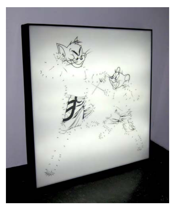
ANTON DEL CASTILLO Face Off Light box 122 x 122 cm. / 48 x 48 in.