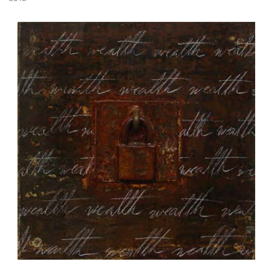
ANTON DEL CASTILLO Vault Series - 2 Metal, board, paint 30 x 30 cm. / 11.75 x 11.75 in. 2010